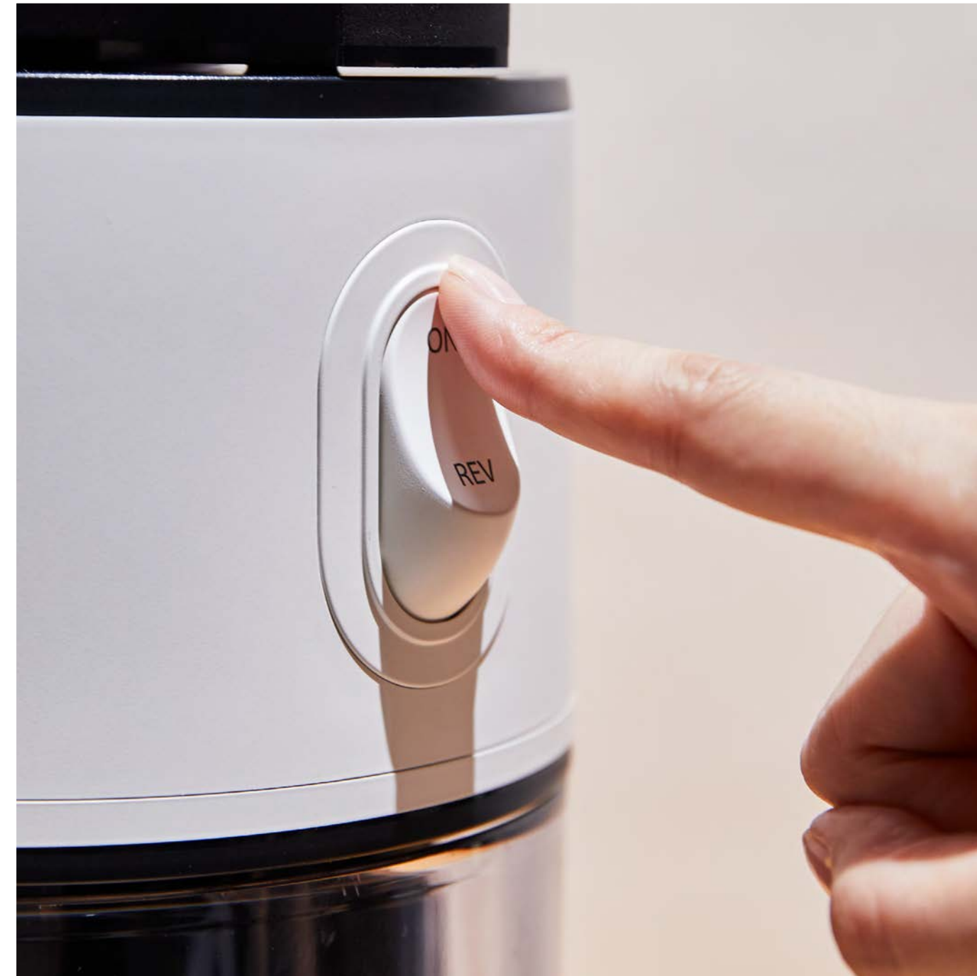
Switch-type power button for better usability