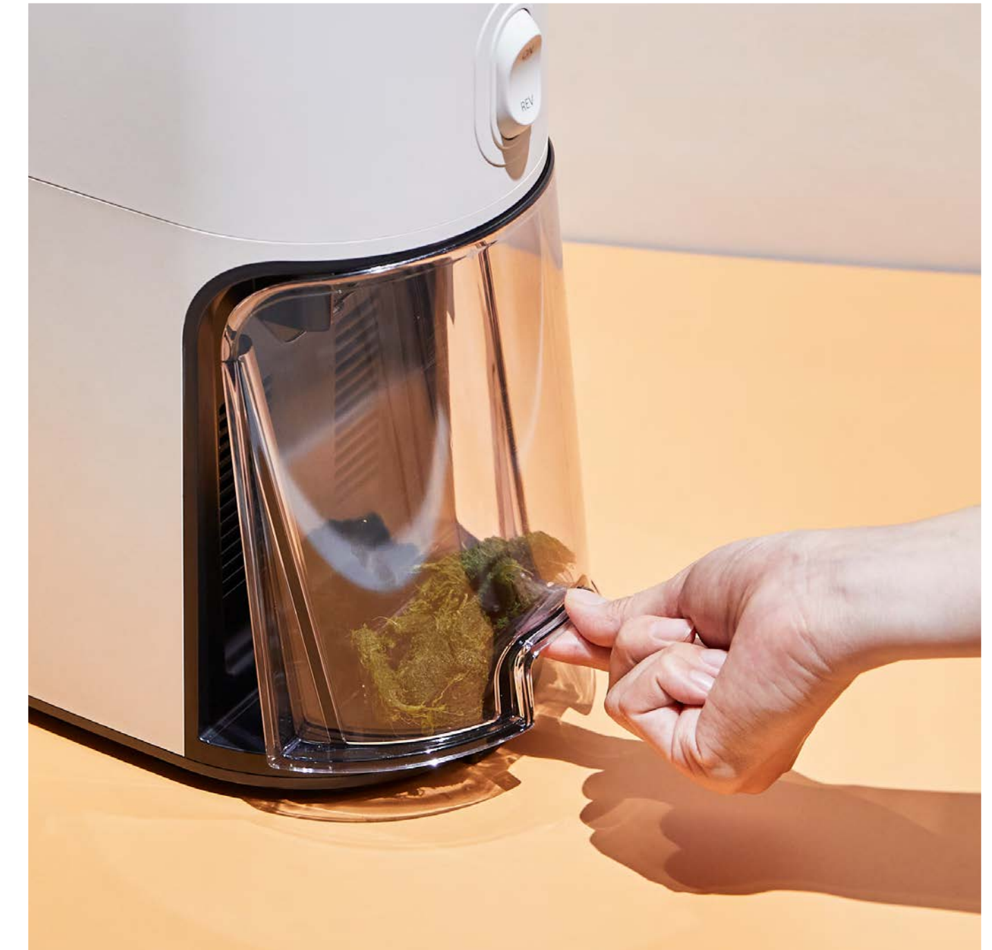
Integrated pulp container that takes up less space