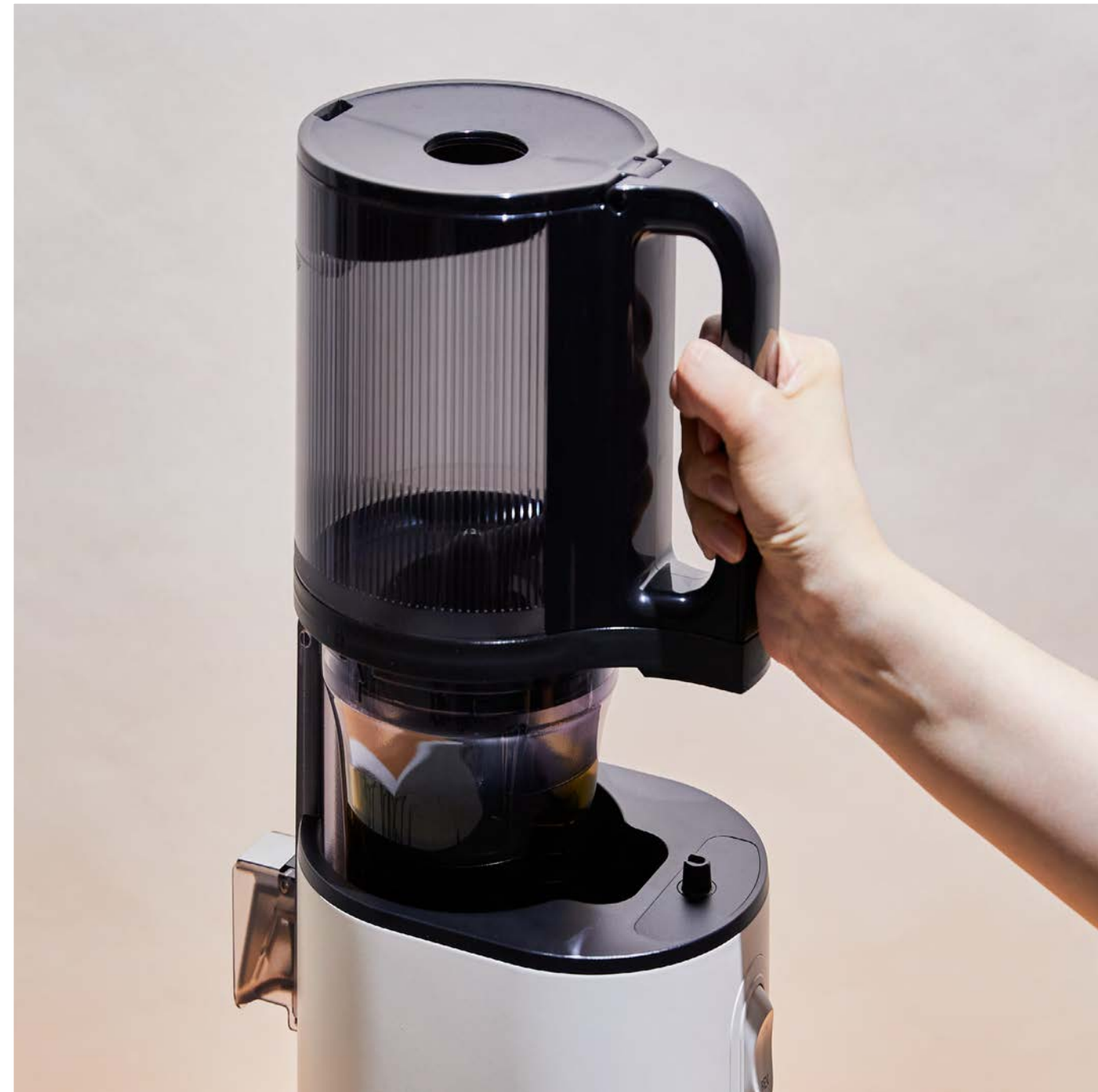
Easy to assemble the body and drum together

With the H400, ease of operation allows for healthy choices amidst a busy schedule